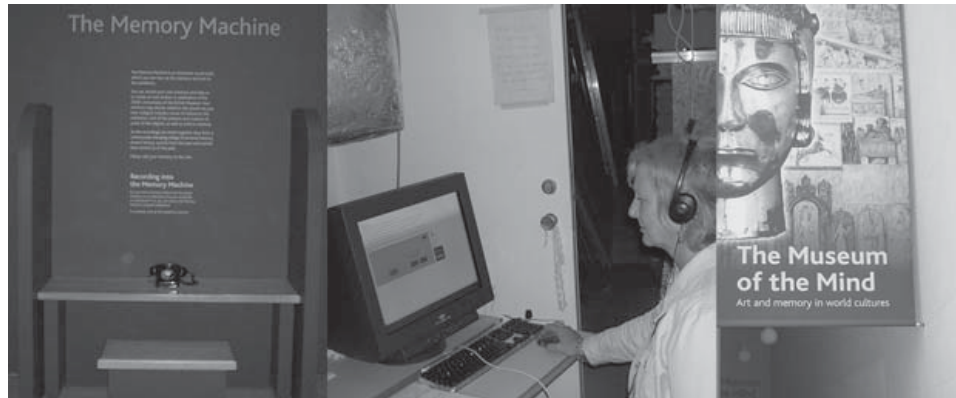
Figure 1. The Memory Machine .

remembering. While most of these are outside the scope of this paper, the concept of memory as a schematic or architectural space as expressed in the Renaissance Memory Theatre has been extremely influential on both our work and the structure of the exhibition as a whole.